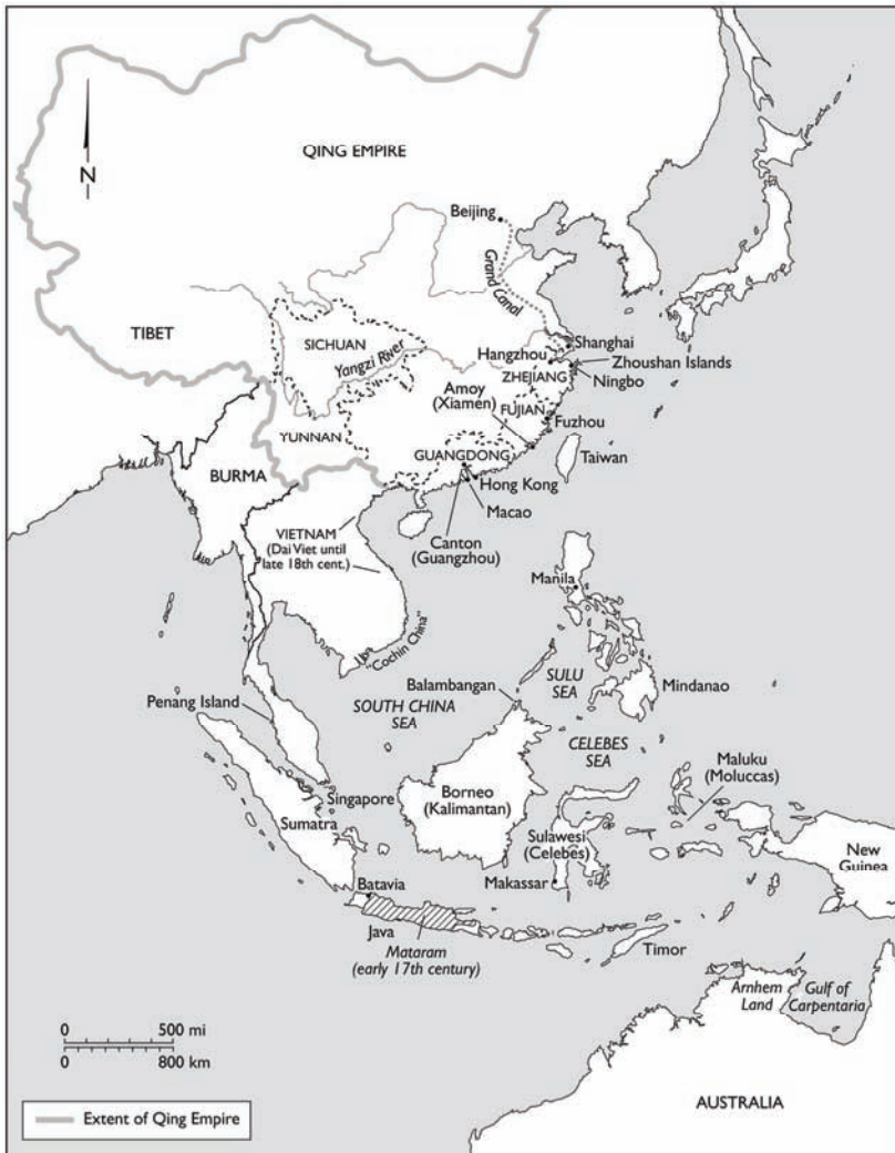
Map 3 East and Southeast Asia in the seventeenth and eighteenth centuries Information about points in Southeast Asia drawn from maps in Pluvier, Historical Atlas of South-East Asia , 30, Cribb, Historical Atlas of Indonesia , 90; Warren, The Sulu Zone , 103.