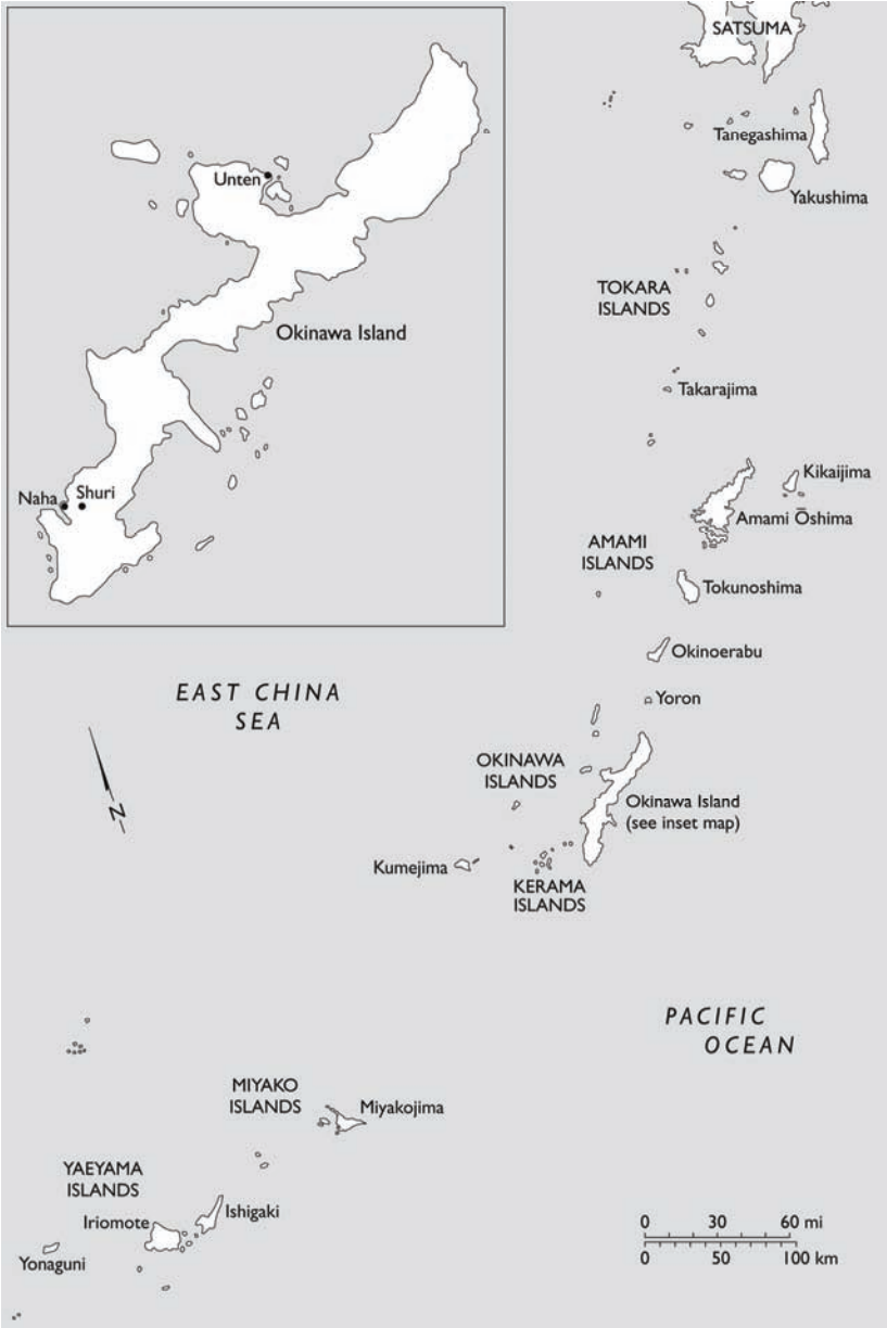
Map 1 The Nansei [Southwest] Islands. The present name for the island groups extending from Kyushu to Taiwan.