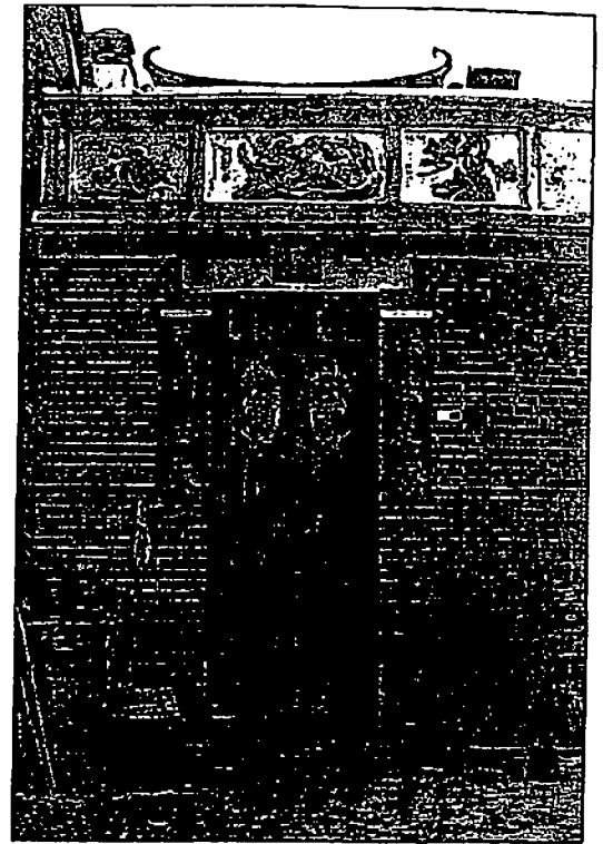
Old village house with red door gods, 1969.

The location of ancestral tombs was of utmost importance. Like many others in southeastern China, local