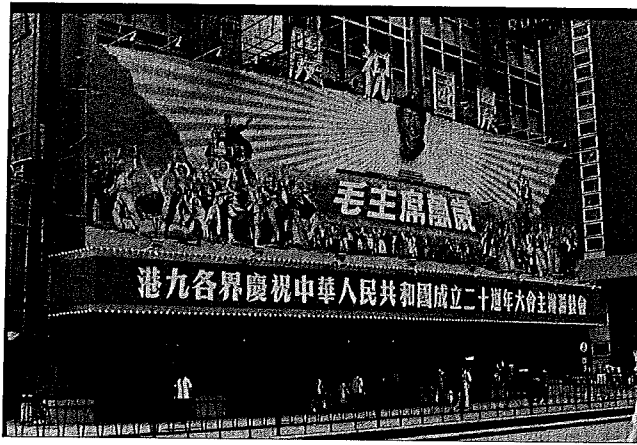
Photo 1: Jordan Road, Kowloon, China Products Store. © J. L. Watson, 1969.

Let me start by taking you back to the late 1960s, during the height of the Cold War: the Vietnam War is escalating daily, and China is in the throes of the Cultural Revolution (see Photo 1). It is in this political context that I caught my first